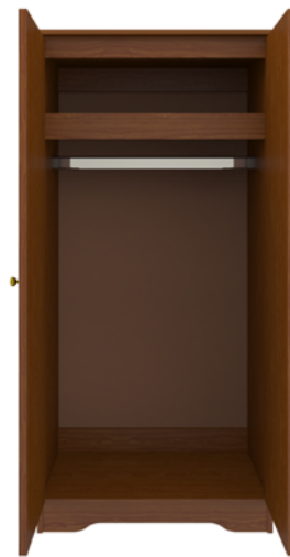
Model: LAWRO2 34.5W 23.75D 71H

The Lancaster Collection offers unobtrusive refinement and skilled craftsmanship to form the perfect balance between function and beauty. Rich OG detailing on the tops and recessed insert panels set into chamfered frames on doors and drawers. Collection available with or without contrasting edges as well as custom color combinations.